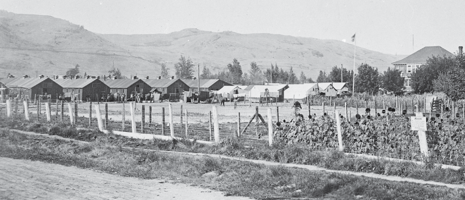
Internment camp for enemy aliens, Vernon, B.C. ca. 1916 Library and Archives Canada, c-017583. Detail. | Camp d'internement pour étrangers ennemis à Vernon, C.-B. Bibliothèque et Archives Canada c-017583. Détail. Domaine public | Public domain.