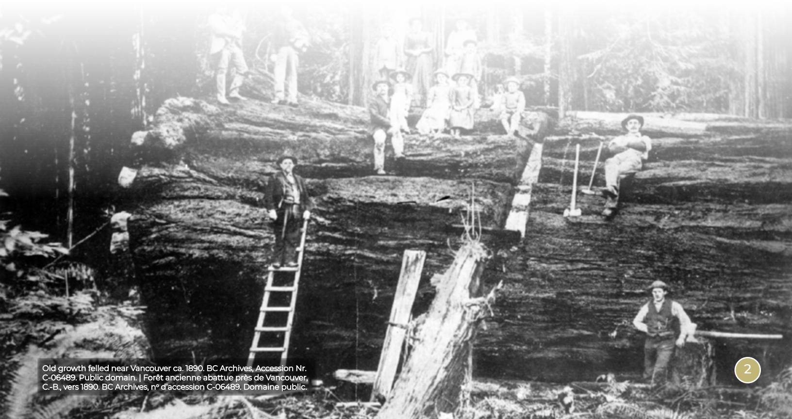
Old growth felled near Vancouver ca. 1890. BC Archives, Accession Nr. C-06489. Public domain. | Forêt ancienne abattue près de Vancouver, C.-B., vers 1890. BC Archives, n° d'accèsion C-06489. Domaine public.

C. Fauchon-Claudon , et M.-A. Le Guennec (dir.). Hospitalité et régulation de l'altérité dans l'Antiquité méditerranéenne . Ausonius, 2022.