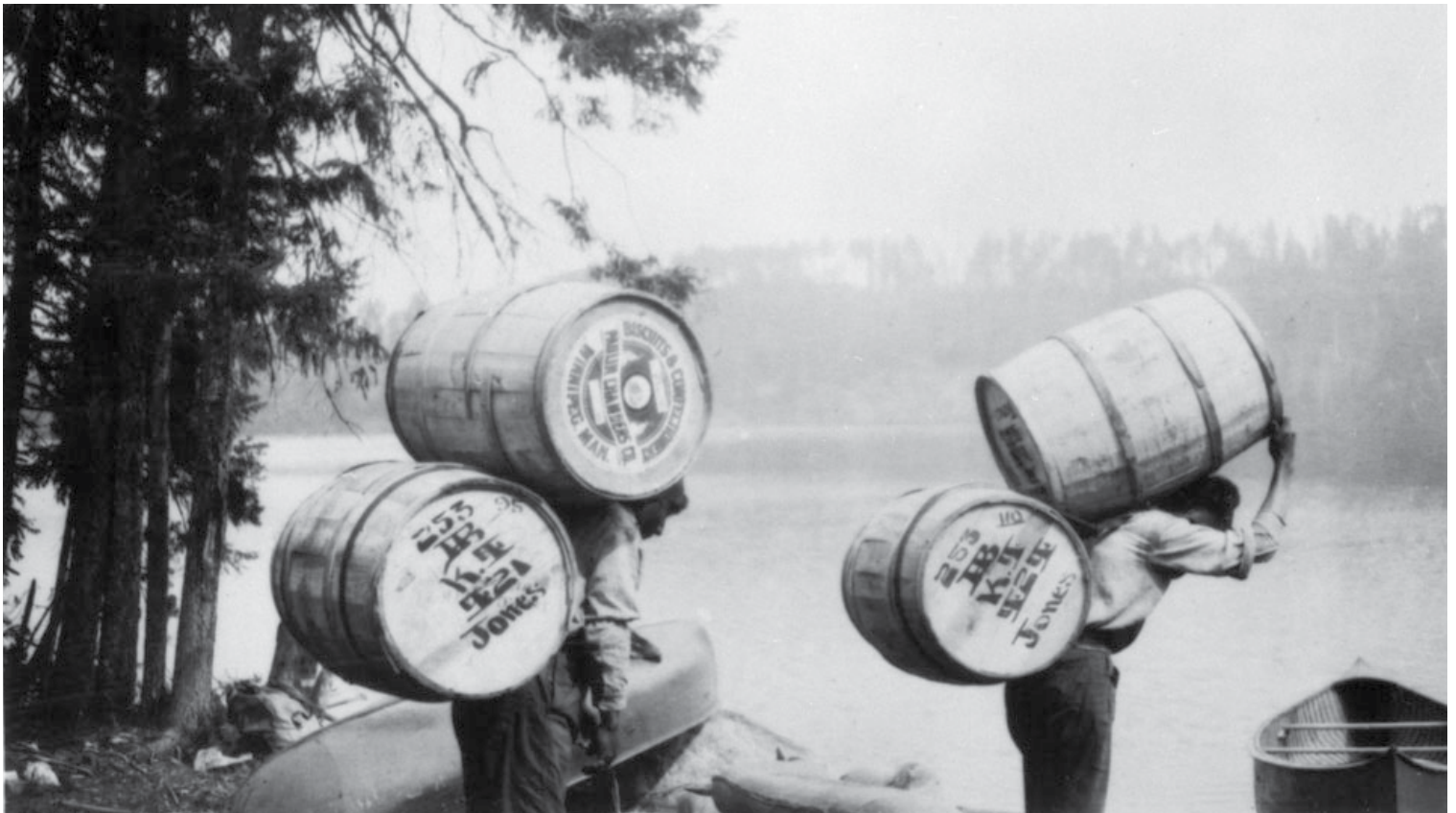
Indigenous packers for the Hudson's Bay Company in northern Ontario, Canada. | Emballeurs autochtones pour la Compagnie de la Baie d'Hudson dans le nord de l'Ontario, Canada.